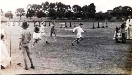
Sprinters unknown, Madden Field c1942