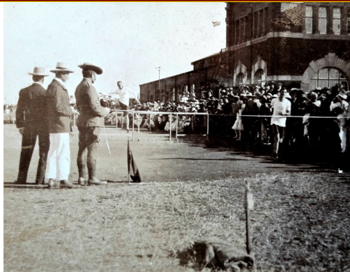
Hurdles c 1913 at Drill Hall, runners unknown