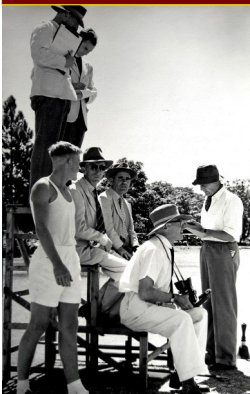
Place Judges, 1959