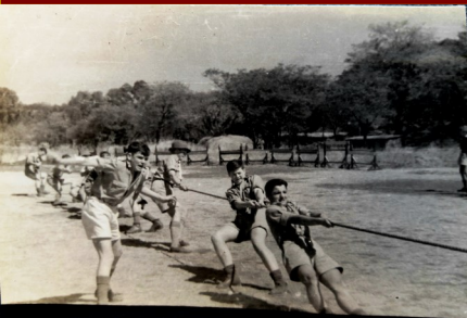
Tug-of-war, Madden Field, c1942