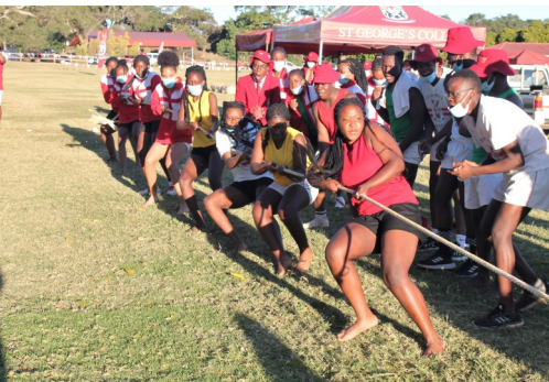
Tug-of-war in a time of Covid, 2021