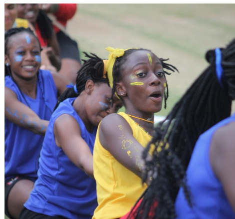
Tug-of-war with a touch of war paint, 2022