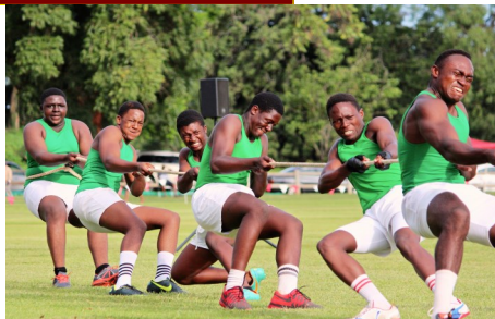
Tug-of-war, Ford Field 2016