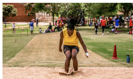
Girl's long jump, March 2023