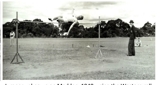
Jumper unknown on Madden, 1949, using the Western roll technique. Notice the sand pit below!