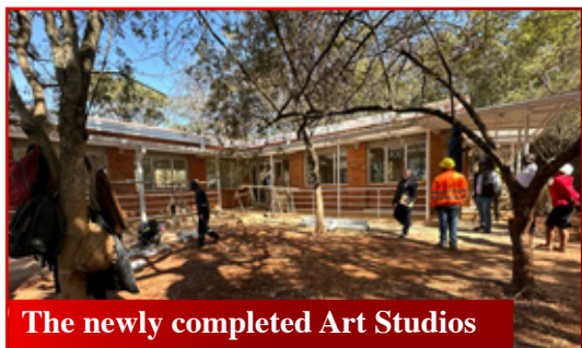
The newly completed Art Studios

As we approach the end of what is the busiest term, we can reflect on a notable set of achievements. Our building and refurbishment programme continues with the completion and handover of two new Art Studios. One of these was funded by the SDC and for this, the College is very grateful. One of the old Art Studios will be converted into a Global Perspectives classroom, whilst the second will be developed into a Graphic Design studio. Refurbishment of the Boarding Hostel area has started, with the development of two new accommodation areas for students in Form One and Form Two.