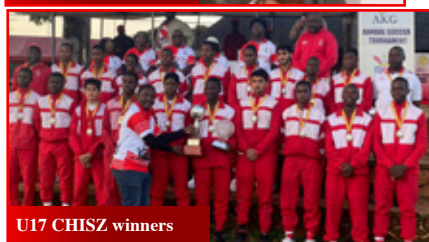
U17 CHISZ winners